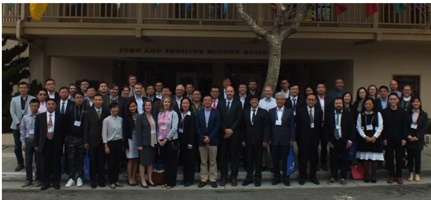
Participants on the first day of conference.

Meet the people who are involved in the operation of ACPS since 2008