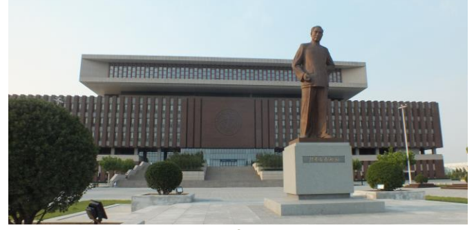
The main library of Nankai University.

Tianjin China, the site of the 30th annual ACPS meeting and international symposium, holds historical significance in China's interactions with the outside world. During the events of the Second Opium War (1856-1860), the Qing dynasty signed the Tianjin treaties, one of the infamous "Unequal Treaties," which gave concessions to six European countries, the US, and Japan to set up permanent trade access to Tianjin's port, churches and residences around the city, as well as diplomatic consulates in Beijing. For the first time in its history China was open to the world, and the world