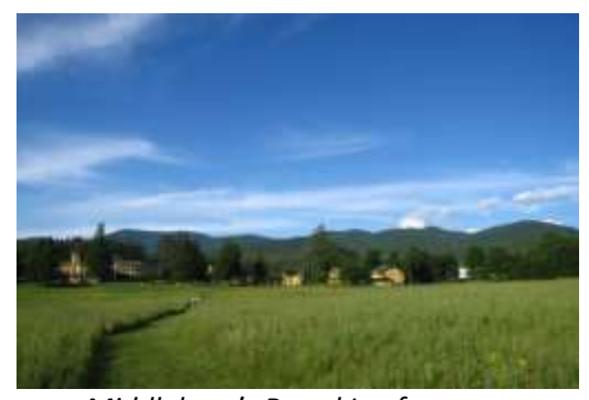
Middlebury's Bread Loaf campus

1.) ACPS's next annual meeting and international symposium will be held September 19-20, 2020 at Middlebury's Bread Loaf campus in Vermont. This conference will focus on mentoring, as did the 2019 Zhejiang University one, but will also have sessions to discuss new methodologies in Chinese politics and publishing with a panel of editors. A call for papers will go out in January.