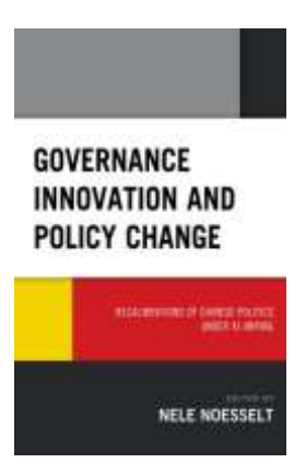
Governance Innovation and Policy Change Recalibrations of Chinese Politics under Xi Jinping

Fueled by its surging economic strength, China has been increasingly utilizing economic tools such as trade, foreign aid, foreign direct investment, and sanctions to pursue strategic and security interests on the world stage. This approach, known as economic statecraft, has thus far received mixed policy results and ambivalent reactions from the international community. This book presents a collection of assessments of China's economic statecraft. The contributors to this volume answer three key questions: What are the challenges faced by China's economic statecraft? Why is China sometimes able to achieve its foreign policy objectives via economic statecraft and sometimes not? How do foreign countries, particularly the targets of China's economic statecraft, respond to China's strategies? This comprehensive study examines economic statecraft in the context of more than a dozen nations and international organizations across four continents, thus providing a truly global perspective.