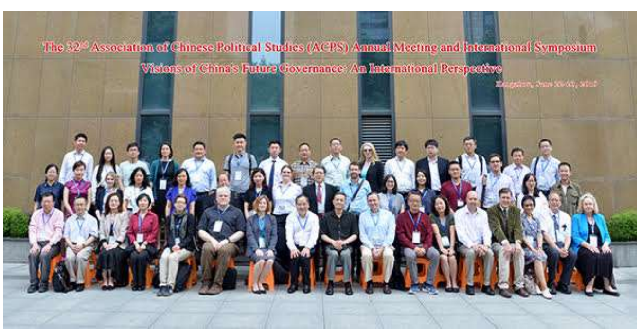
Participants in the annual meeting and international symposium

The conference closed with an ACPS Business Meeting whose topics included growth, professionalization and institutionalization of ACPS; publisher matters concerning the Journal of Chinese Political Science ; networking, future research, and collaboration; and new membership recruitment. Participants in the conference came from universities in China, the United States, Canada, Austria, Germany, Hong Kong, and South Korea.