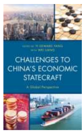
Challenges to China's Economic Statecraft A Global Perspective